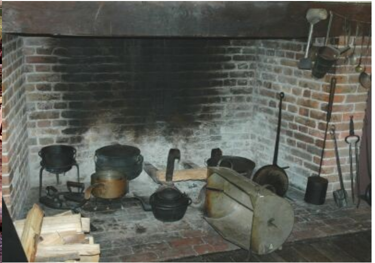
fireplaces preceded stoves