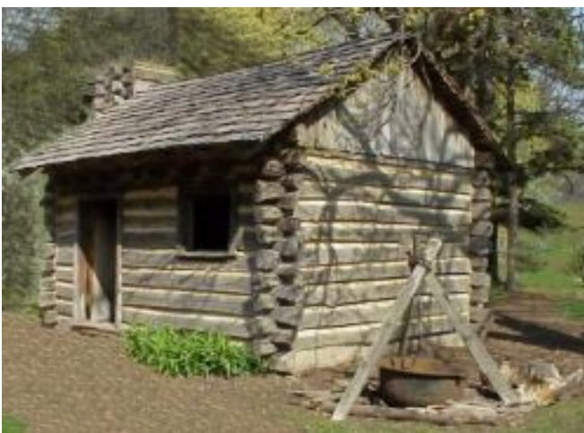
Cooking was first done outside