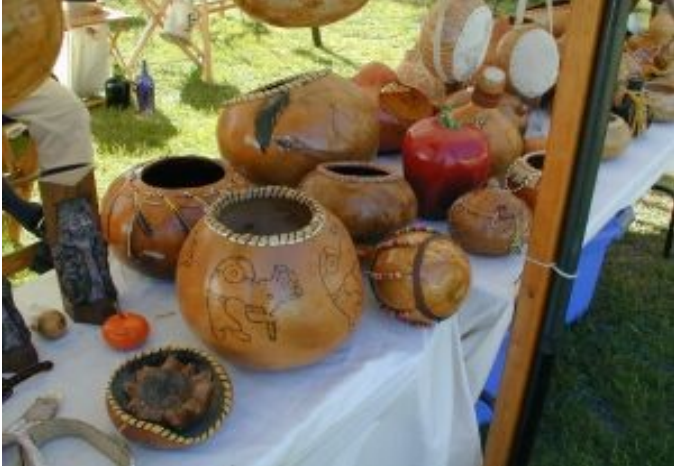
Gords used for containers