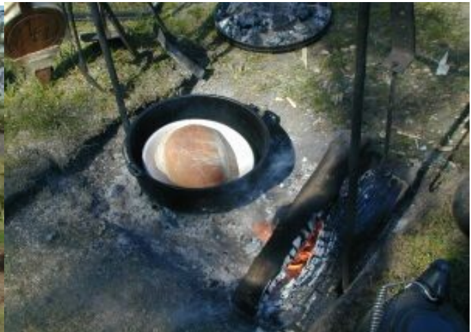
cast iron pots