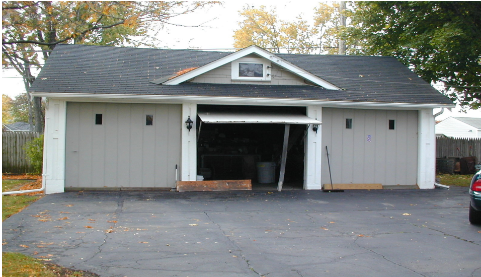
This is original Carriage Barn