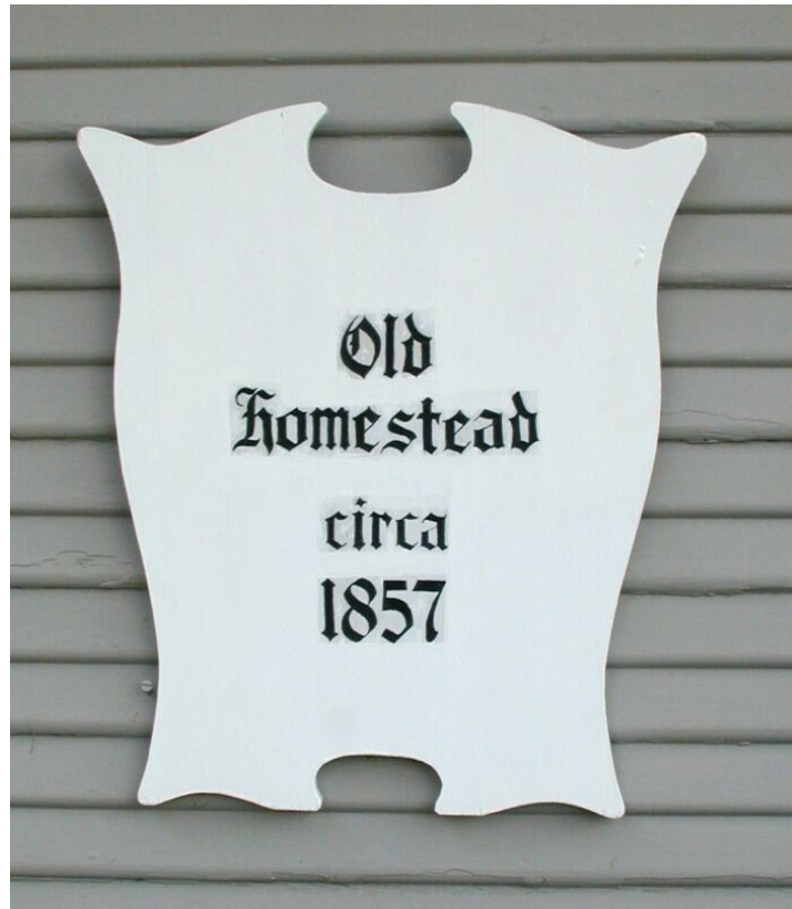
Sign on cook house said Old Homestead circa 1857