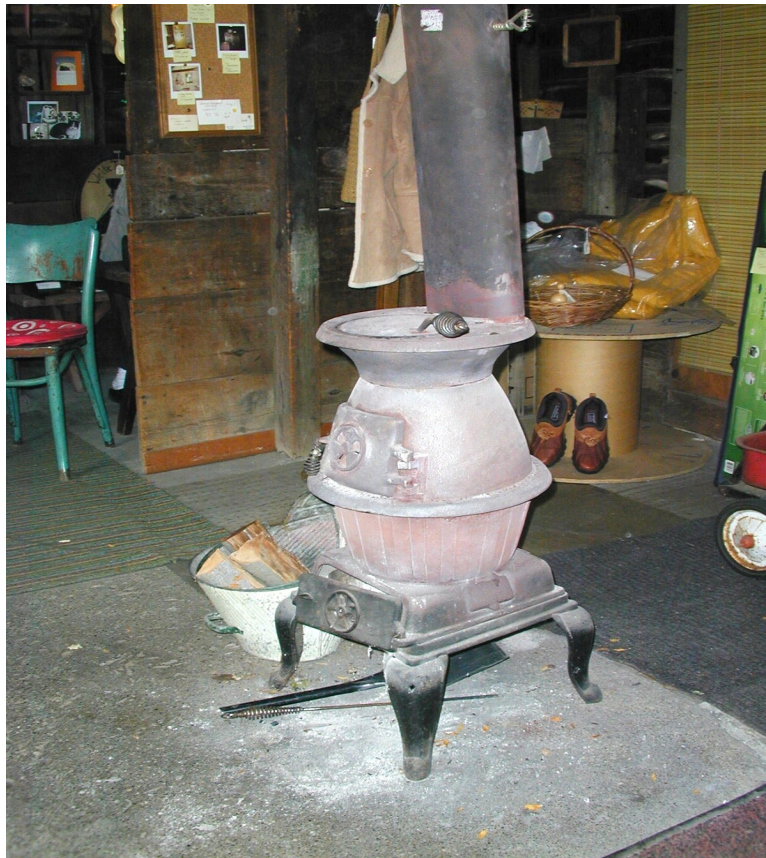
Pot belly stove in cook house although not the original cook stove it does fine for heating and cooking for family events. One of the joys of a wood stove is the satisfaction one gets from putting junk mail to good use.