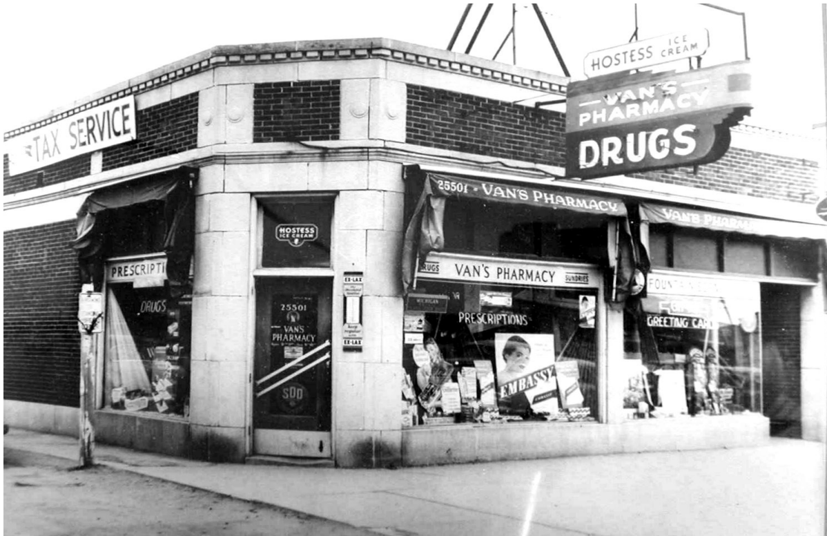
Van's Pharmacy 25501 Van Dyke Center Line Michigan Van's Drug Store