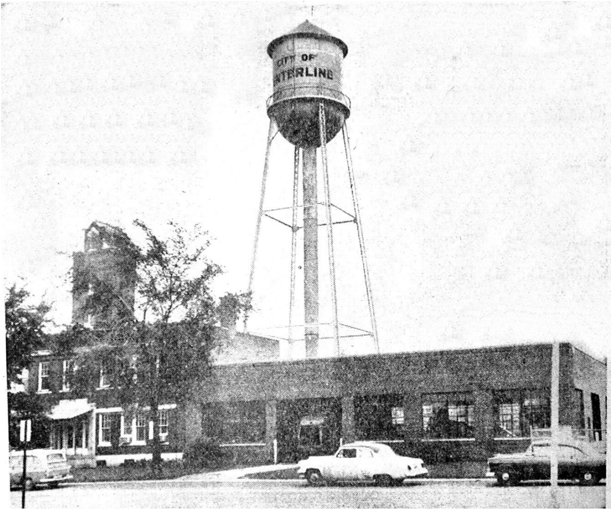
Center Line City Hall with Water Tower 1950s