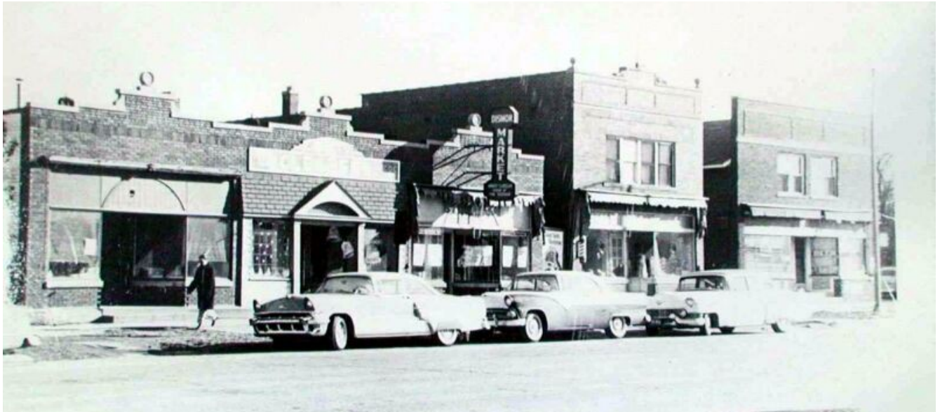
Buechels old store and other stores on East side of Van Dyke in the 1950s