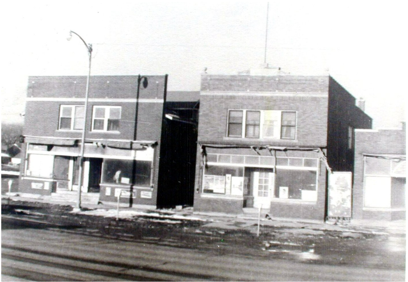
Old stores on east side of Van Dyke just south of St Clement church in late 1950s just before they were torn down for new St Clement church.