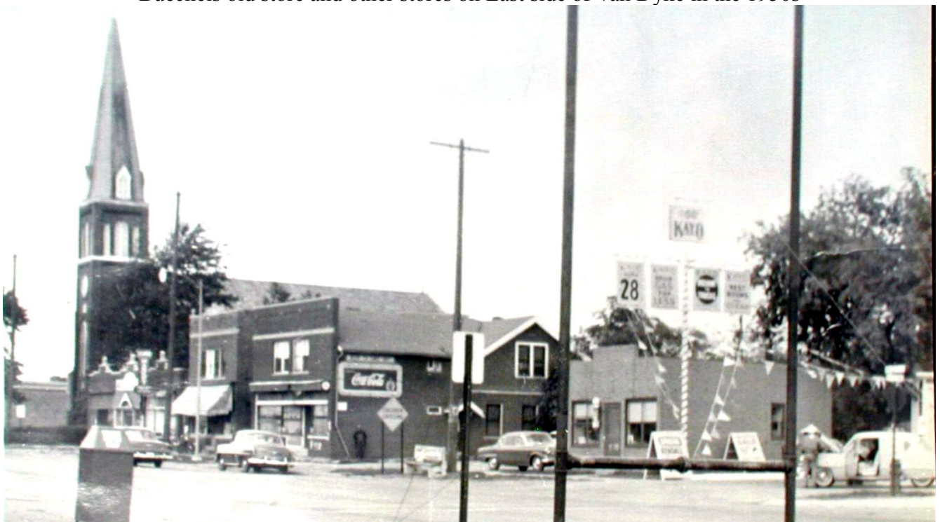
Old stones on East side of Van Dyke and Kayo gas station. Note gas 28¢