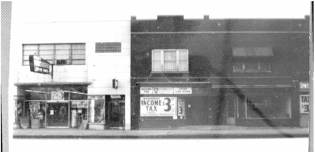
Old Wolf Hardware and block of stores just south of it in late 1950s