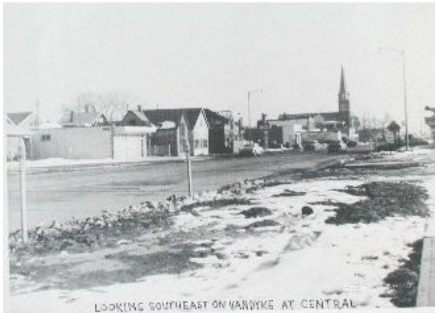
LOOKING SOUTHEAST ON VANDYKE AT CENTRAL Looking southeast on Van Dyke at central