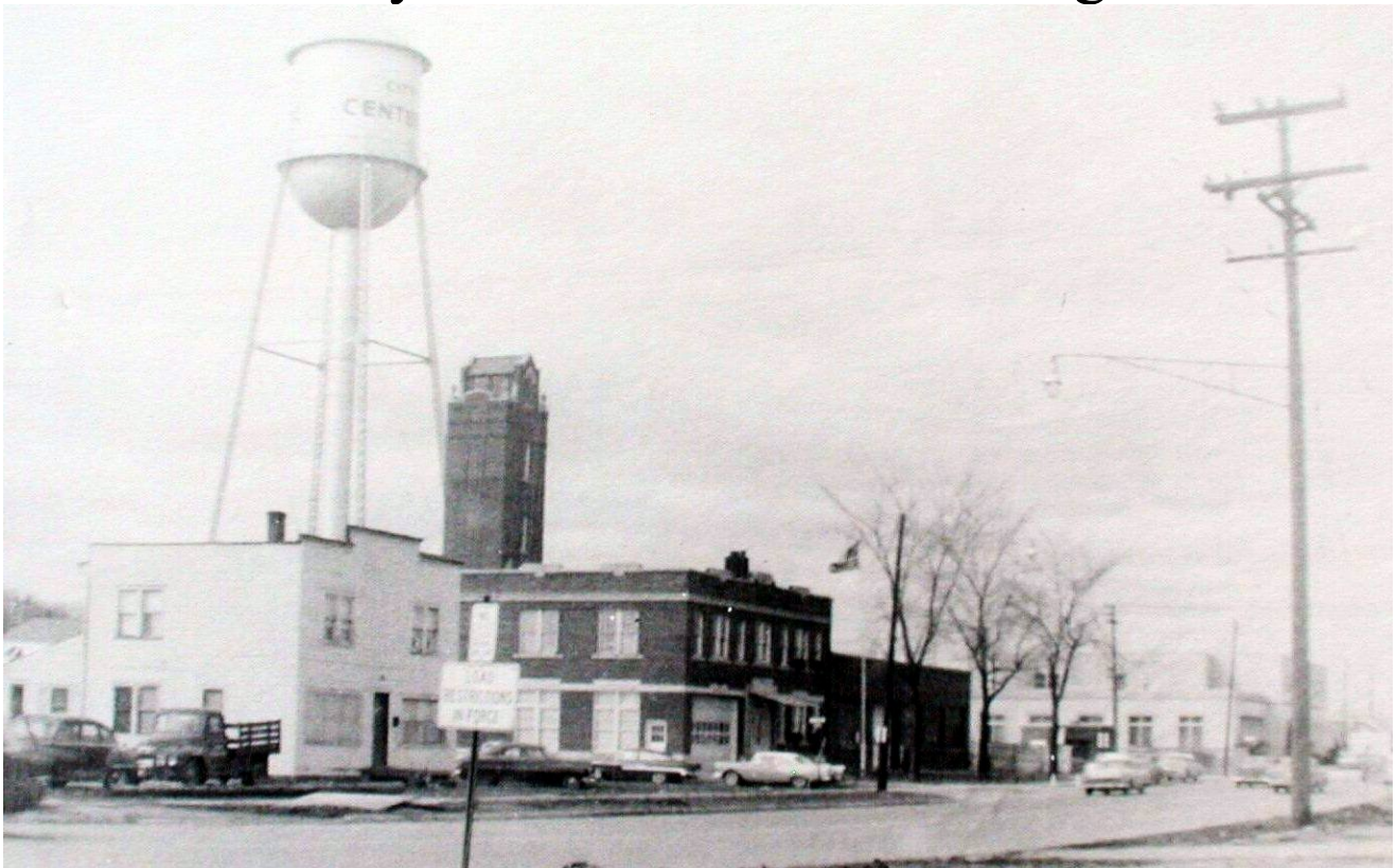
Water Tower Municipal Building Center Line 1950